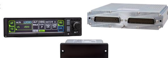
TABLE 1. AEROCRUZE 230 SAMPLE FEATURES AND THEIR BENEFITS

AeroCruze 230 packs a lot of features and makes your decision effortless in upgrading your KFC 150/200 autopilots. A sample set of features/benefits is given in the table below.