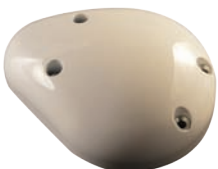
Active LGA Antenna