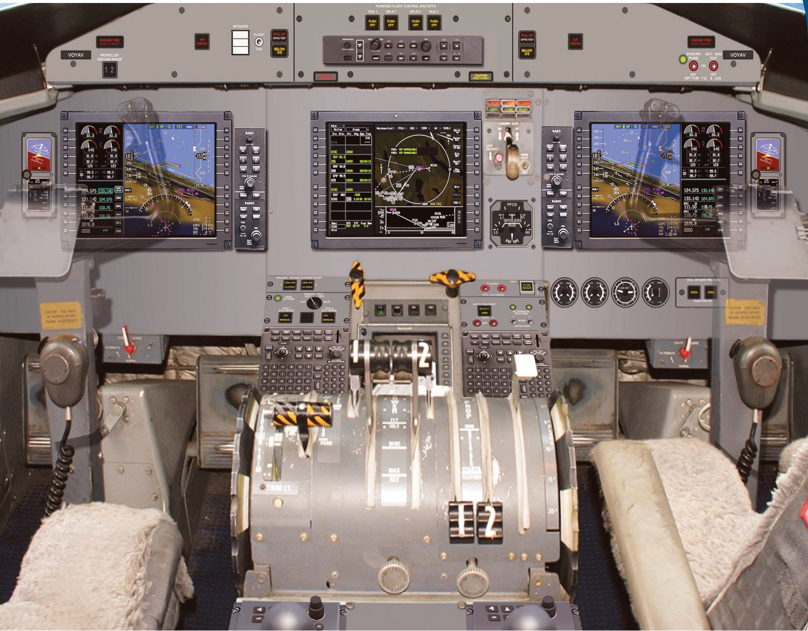
AeroVue Integrated Flight Deck For the Dash 8 Aircraft